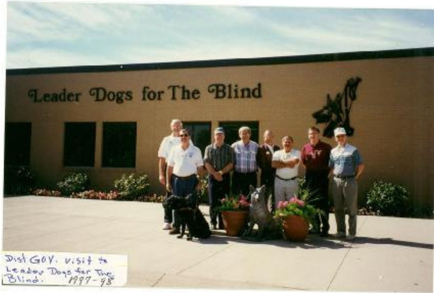
Dist GOV. visit to Leader Dogs for The Blind. 1997-98