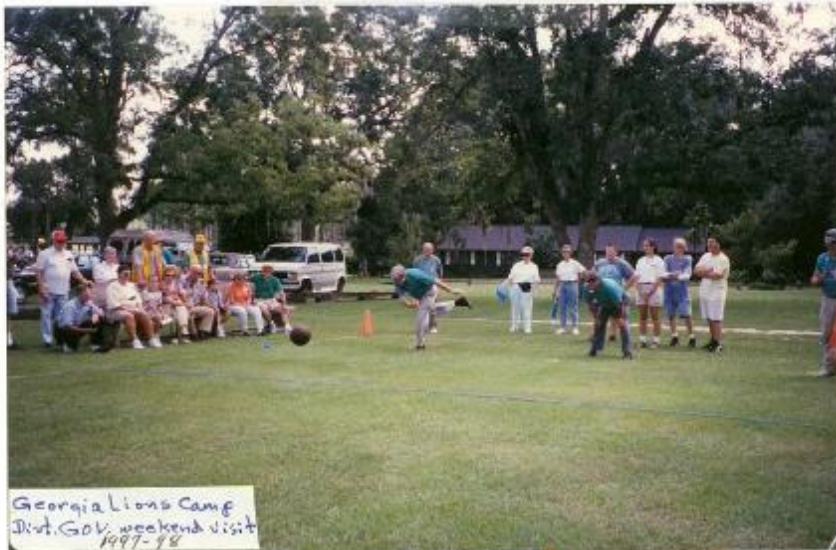
Georgia Lions Camp Dist. GOV. weekend visit 1997-98