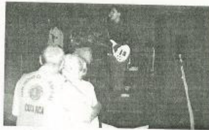
A Costa Rica Lion enjoys himself at the Georgia Jamboree at the 77th Annual convention of International Lions in Phoenix.