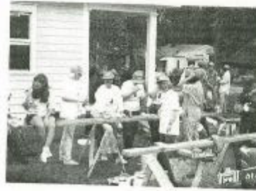
"Peachtree Lions Club of North Atlanta for its World Service Day project are shown working on a house being built by Habitat for Humanity."