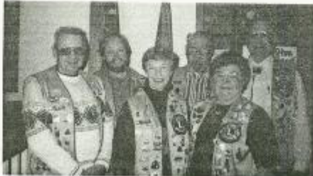
Union County Lions are shown attending the District 18-D Convention and Cabinet Meeting, March 10.